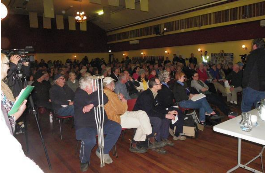
Picture: 14 September 2017 over 350 or about 20% of the community members attended.

There are multiple and compelling why the proposed logging of the three coups near Mirboo North should be excluded by VicForests.