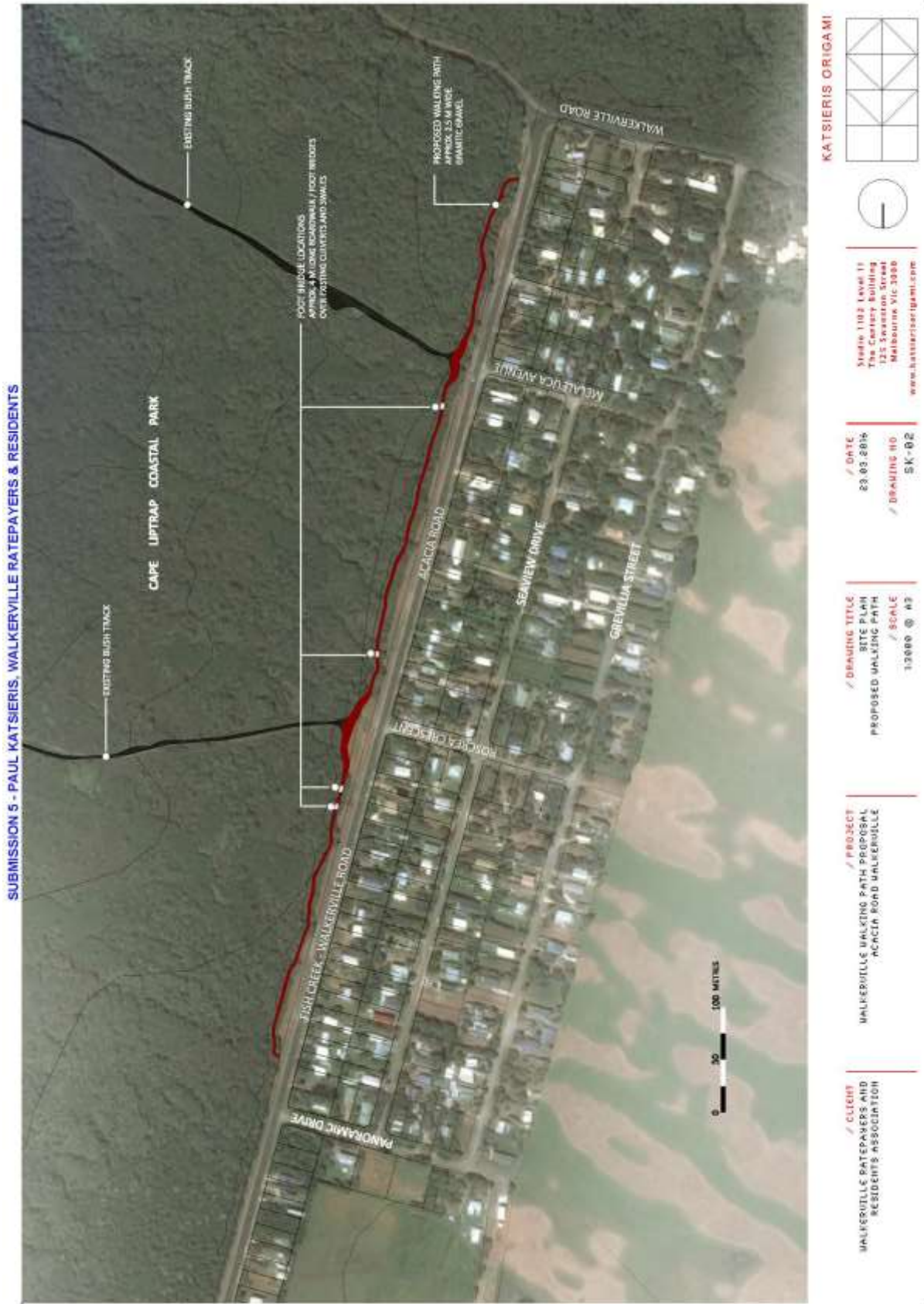
SUBMISSION 5 - PAUL KATSERIS, WALKERVILLE RATEPAYERS & RESIDENTS