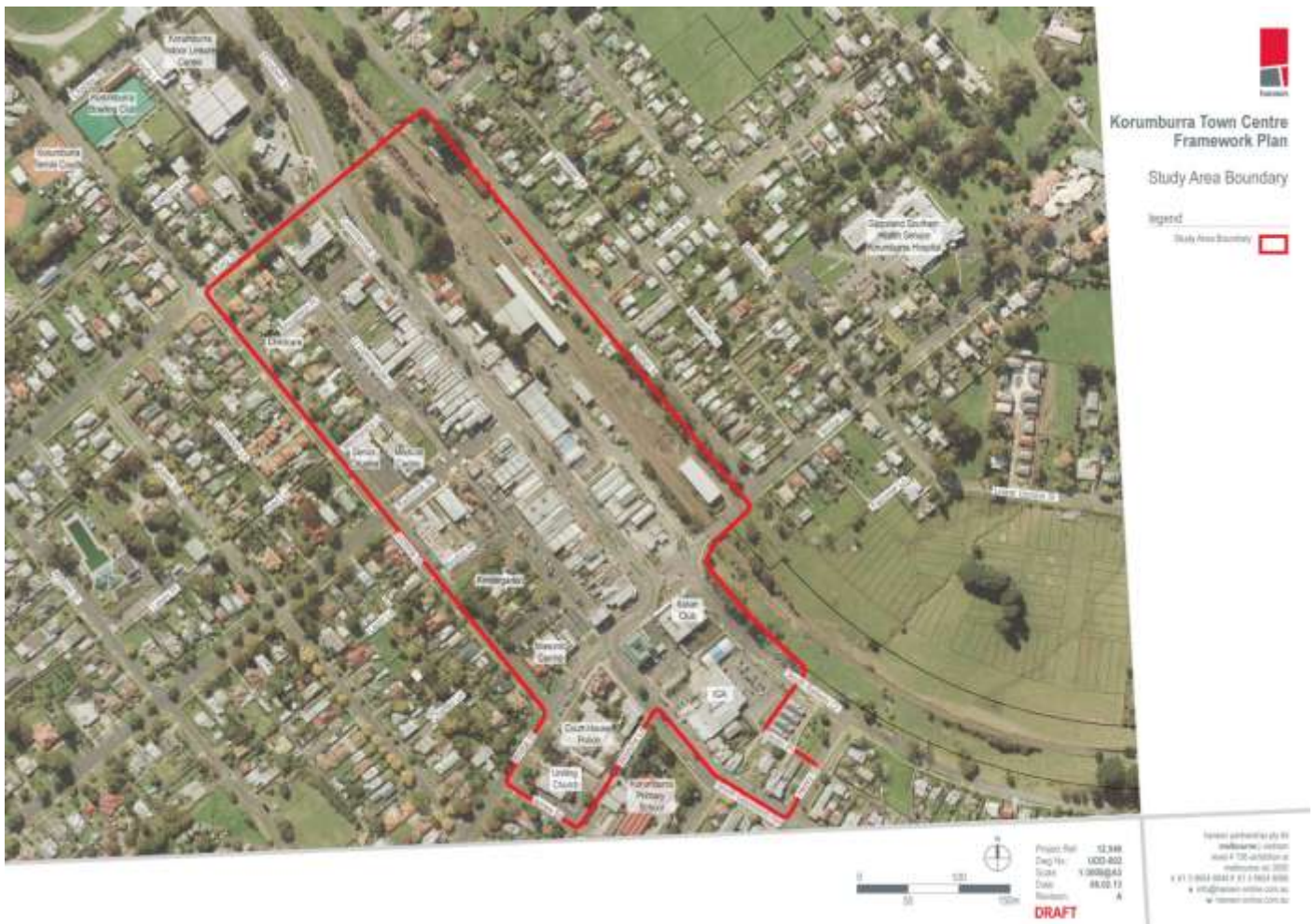
Figure 1. Korumburra Town Centre Study Area

The town centre study area is illustrated below.