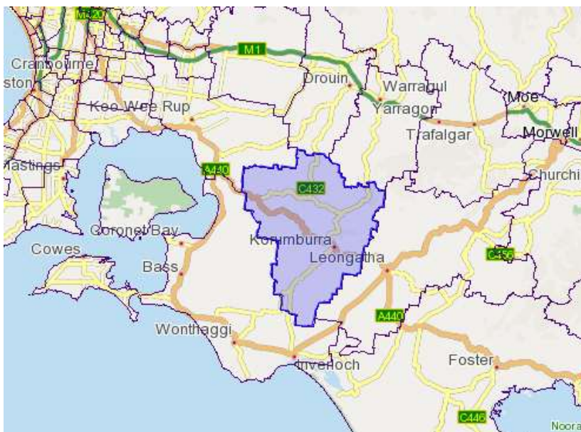
Figure 2. Trade area of Korumburra town centre

All of these centres have supermarkets and compete with Korumburra town centre for the spending of local residents on food and groceries and convenience items. These larger centres also compete strongly in non-food segments such as clothing, homewares and recreational goods (each of the main surrounding centres except Leongatha has a discount department store).