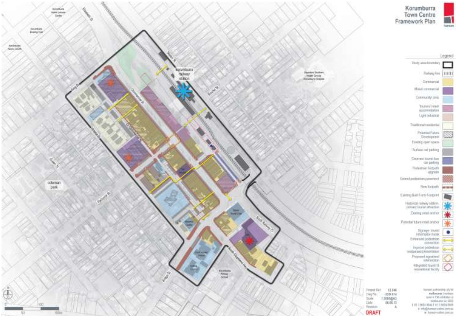
Figure 5. Draft Framework Plan, Korumburra Town Centre