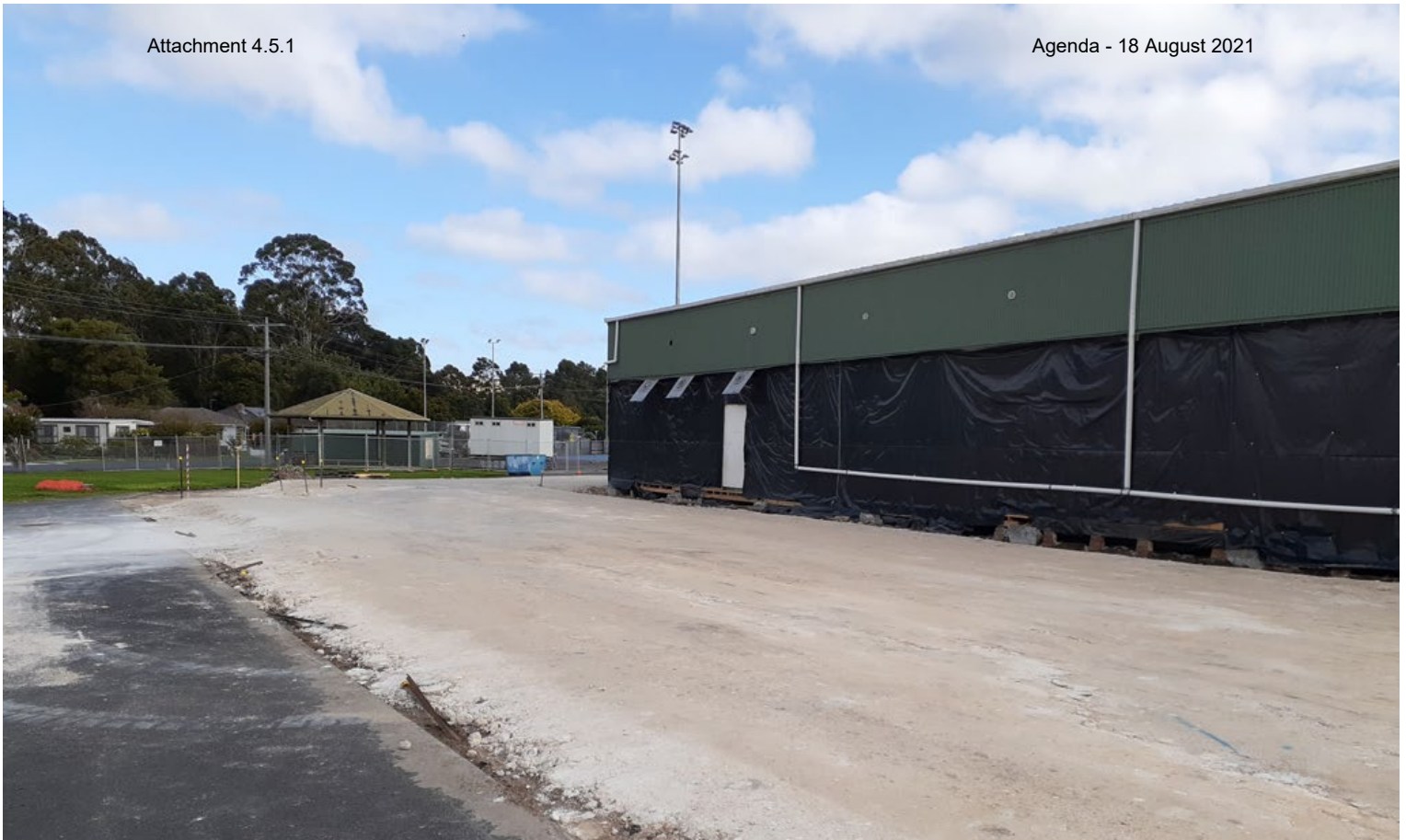
Works underway – Foster Stadium Redevelopment