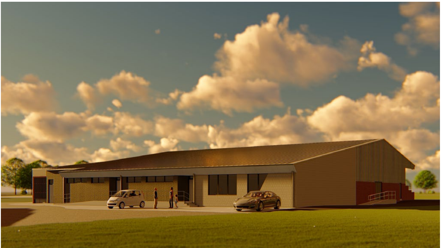
Artist impression – Foster Stadium Redevelopment