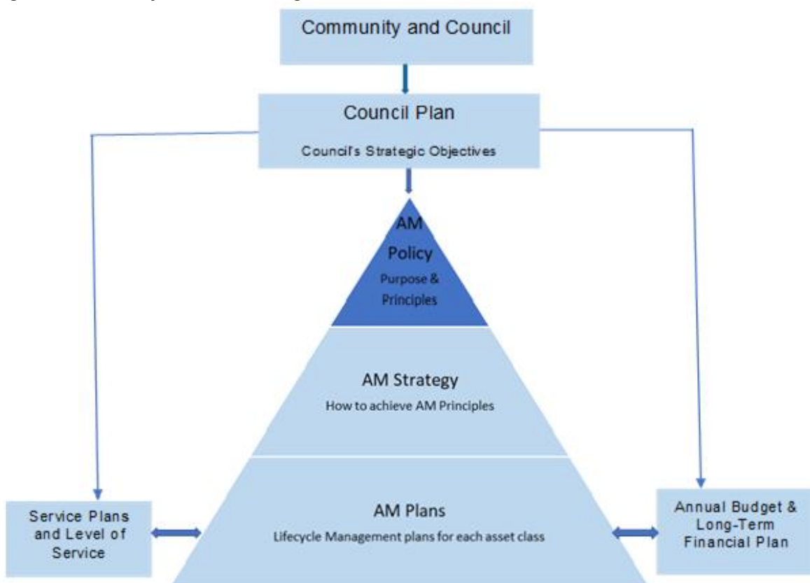
Figure 1: Hierarchy of Asset Management Documents

The Policy outlines the framework, guiding principles, roles, responsibilities, and risks associated with asset management at Council. The previous Asset Management Policy (Attachment [4.6.2]) and Asset Management Strategy were adopted in April 2017.