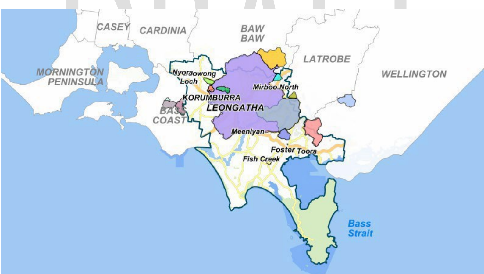
Figure 1 – South Gippsland Shire Council wastewater areas

South Gippsland Water works in partnership with Council in planning and implementing appropriate infrastructure developments, determining which properties are unable to contain wastewater within their boundaries and to recommend priorities for the provision of sewerage services. They are the key primary authority in setting the scope and direction of the extension of mains sewerage infrastructure across the Shire.