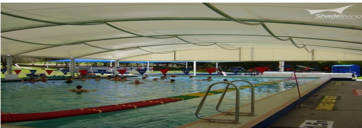
Toora pool barrel arch membrane similar to that proposed for Foster

In order to encourage increased use of the pool protection from the sun and wind is required. This can be accomplished in several stages over the medium to longer term. A barrel arch PVC membrane structure over the main outdoor pool is envisaged. This would provide protection year round and would extend the seasonal opportunities for pool usage. Quotations from Shadeliving , Appendix 3, indicate that the cost involved would be around $200,000. The Foster Pool Working Group recognises that this is a significant funding option but given a targeted fund raising approach is confident this could be achieved in the medium to longer term. In the shorter term less ambitious shading options will be explored.