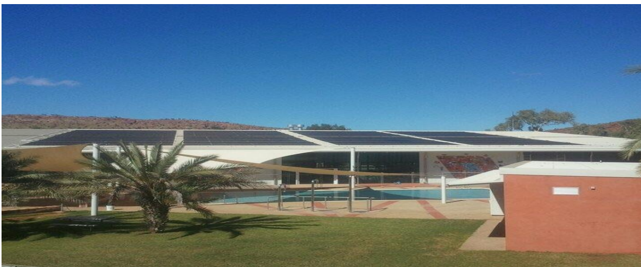
An example of a shading area that could also include solar panels on the roof

Note that a combined polycarbonate structure could be designed to have the strength to support the solar panels and provide shading for the pool similar to the photo below. This structure would be more costly than PVC barrel arch described below but given the total costs of the heating and shading proposals a combined structure would probably be more cost efficient than if each element of the proposed improvements were undertaken separately. If a decision is made to combine the two objectives of heating and shelter into a single stage rather than separately over a few years then a combined structure would be logical. It is also worth noting that whatever design/cost outcome the proposed FPA would determine in this regard the costs would rest with the FPA and that Council & ratepayers would not necessarily be called upon to contribute. This report is not designed to provide a definitive plan but indicates research that establishes that suitable models exist and are within the fundraising capacity of the community provided there is in principle Council support for the FPA fundraising activities.