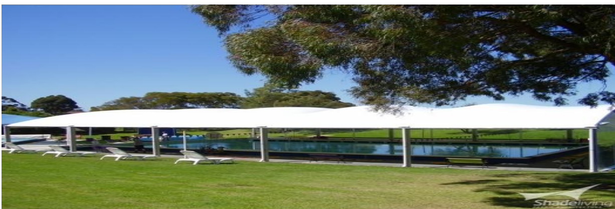
Shading at the Toora pool similar to that envisaged at Foster in the medium term

To retain heat and exclude weather conditions a roofed structure enclosing the pool is being considered to extend the length of the swimming season. It could have either open sides, permanent sides or removable sides.