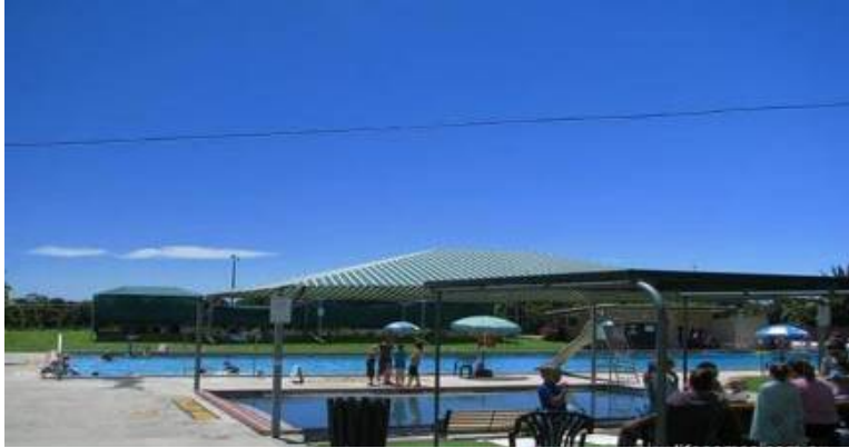
35m x 6 lane pool Toddlers' pool