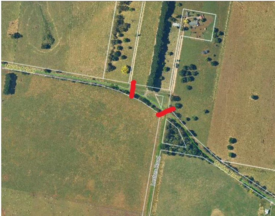
Figure 2 – Aerial of 630 Mardan Road (Proposed New Cattle Underpass