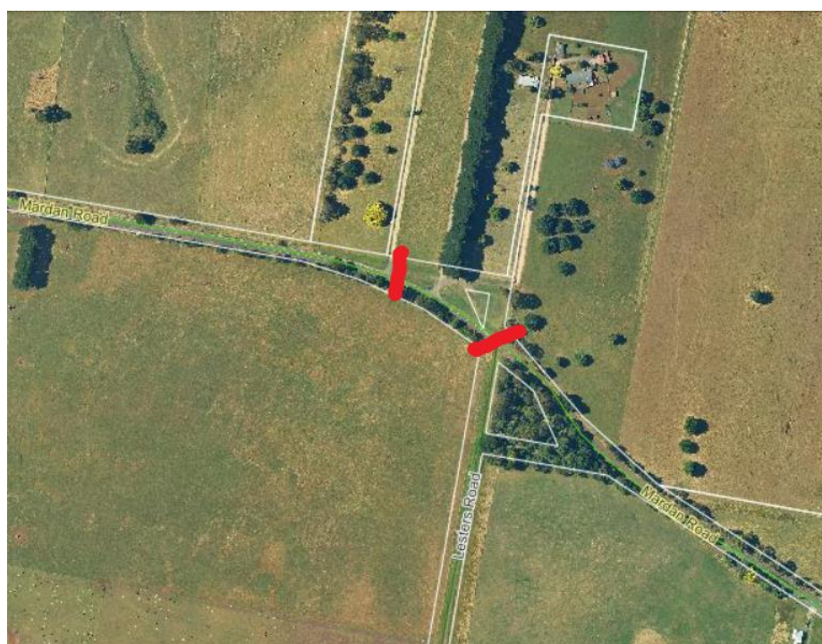
Figure 2 – Aerial of 630 Mardan Road (Proposed New Cattle Underpass

It is possible to place an underpass directly from the Lesters property in two separate positions shown on the map below, however, this would not resolve the tractor crossing.