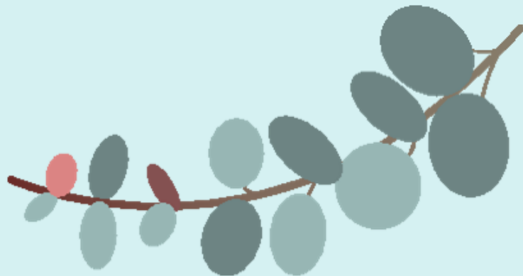
eucalyptus, (genus Eucalyptus)

We acknowledge the Bunurong and Gunaikurnai people as the Traditional Custodians of South Gippsland and pay respect to their Elders, past, present, and future, for they hold the memories, traditions, culture, and hopes of Aboriginal and Torres Strait Islander people of Australia.