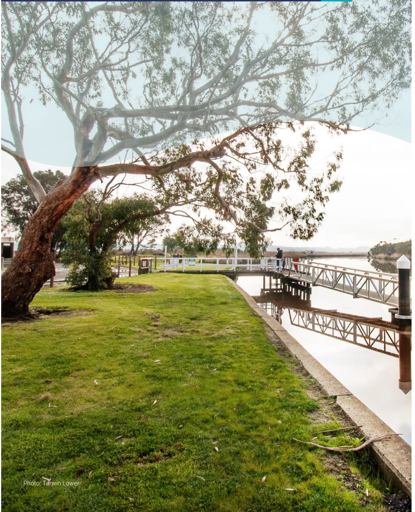
Photo: Tarwin Lower