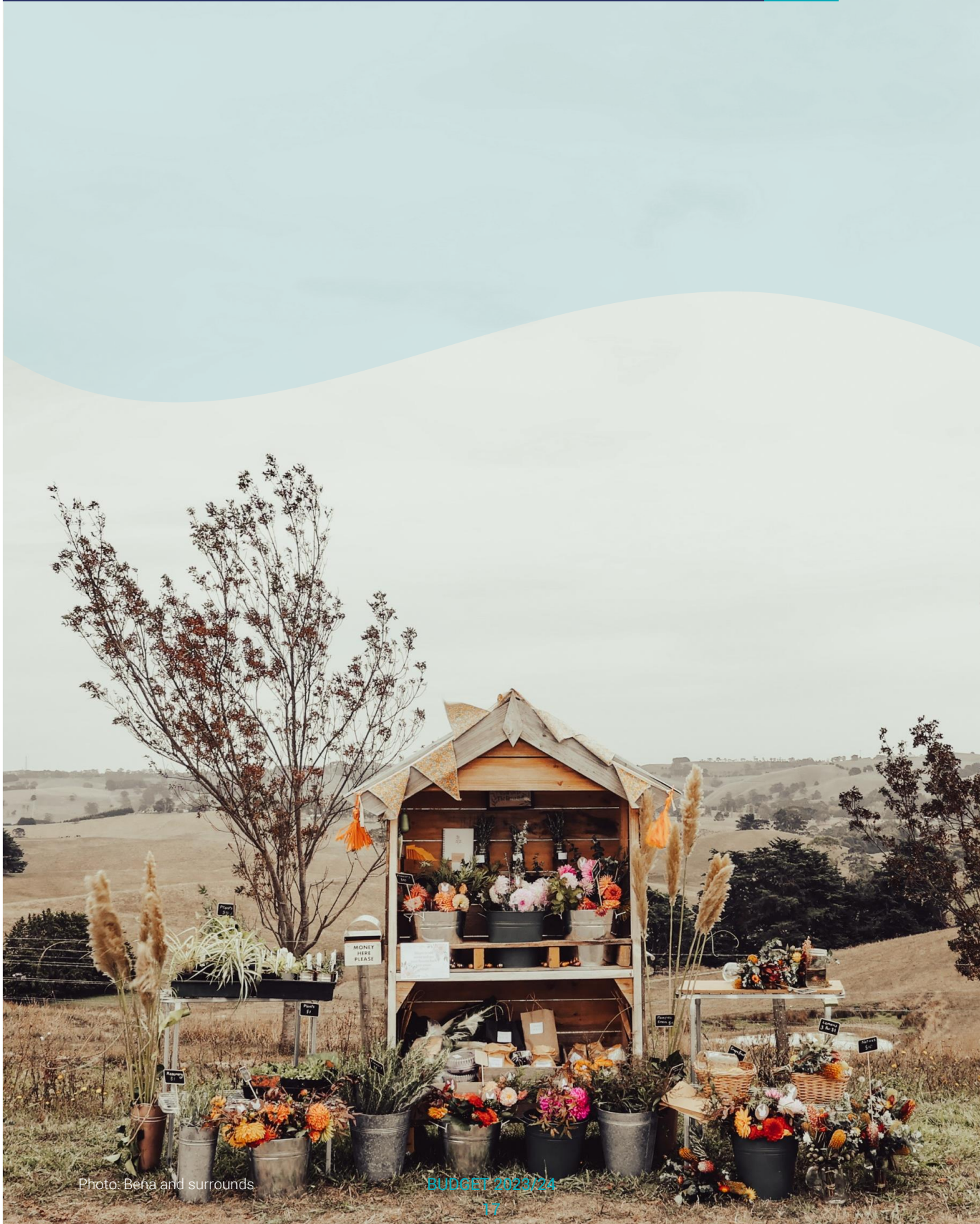
Photo: Beha and surrounds