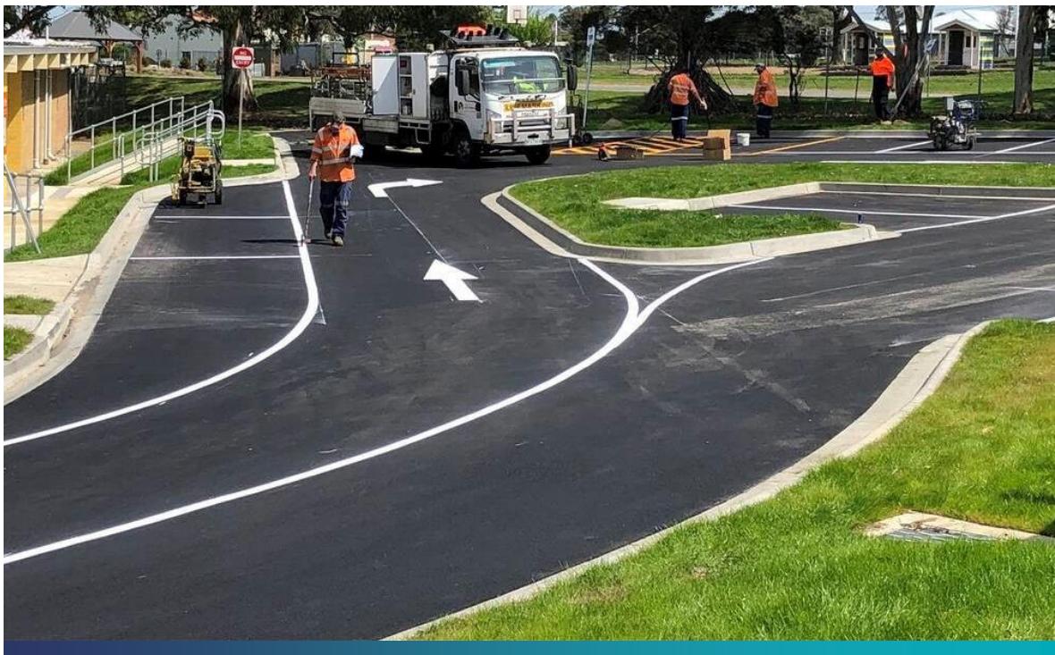
Council's Road Crew

As community needs change, councils need to have robust processes for service planning and review to ensure all services continue to provide value for money and are in line with community expectations. Council has completed a number of service reviews, and has made a commitment in the Council Plan to continue this program of reviews; engaging the community and service users in decisions that affect them. This engagement helps Council to prioritise resources and balance service provision against other responsibilities such as asset maintenance and capital works. The combination of all of these various services and plans informs the content within the Budget.