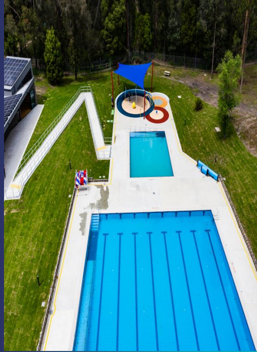
Mirboo North Pool

This Budget is a key strategic document that outlines the services and projects Council provides for the South Gippsland community and the resources required for the 2023/24 to 2026/27 financial years.