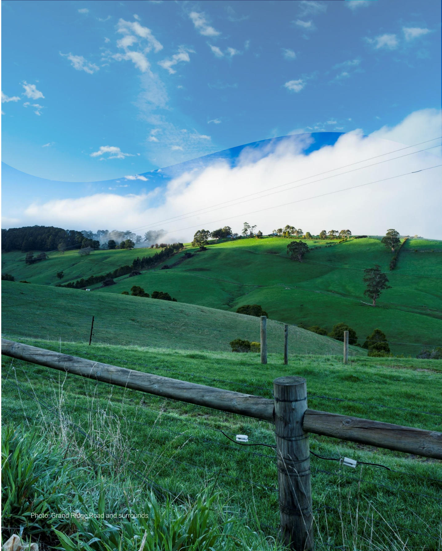
Photo: Grand Ridge Road and surrounds