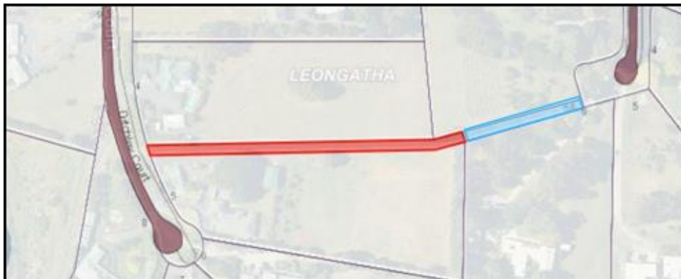
Figure 4 – Remaining Small Reserve Strip (highlighted blue)

If Council, choose to sell part of the reserve the small reserve strip off Davis Court will remain, but the community engagement process may produce interest in the site.