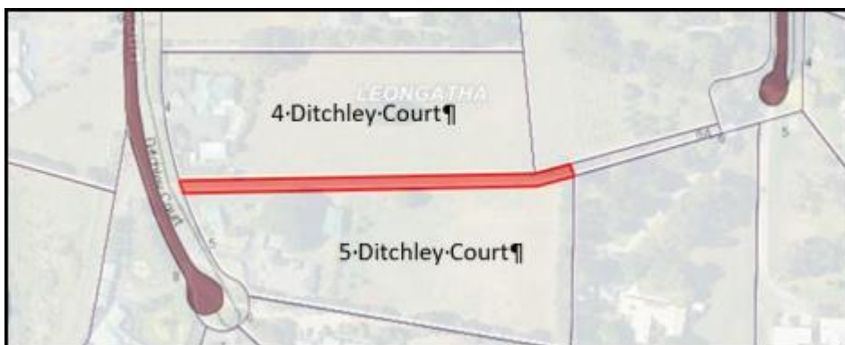
Figure 1 – Reserved Land (highlighted red)

Council's Property Team has been approached by the owner of 5 Ditchley Court, Leongatha to purchase a portion of the reserve. If Council were to sell the land, the reservation status would be required to be removed.