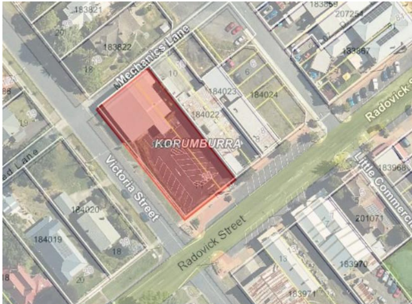
Figure 3 - 14 Radovick Street, Korumburra

This property is locally known as the “Korumburra Senior Citizens Centre”. The use of the building has been occurring on a handful of days a month. During the development of the Korumburra Community Hub concept, an area was provided within the new Hub to accommodate the Korumburra Senior Citizens with priority use for the days required. The club have vacated 14 Radovick Street and have not taken up their place in the Hub.