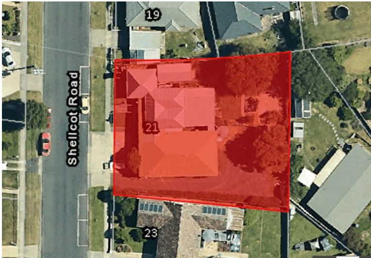
Figure 4 - 21 Shellcot Road, Korumburra

This property was locally known as “Milpara Community House”. The Korumburra Community Hub concept provided an area that was to accommodate the Milpara Community House’s activities and programs. The former lease over the premises that was signed by both parties included the clause: