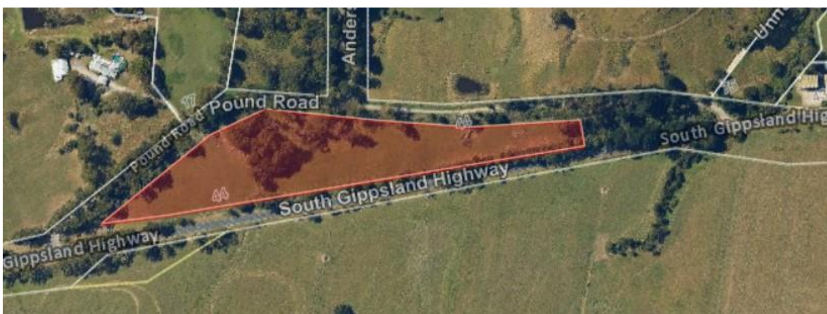
Figure 2 - 44 Pound Road, Foster

This property is locally known as the “Foster Pound Paddock” as it was used by the former Shire of South Gippsland to impound stock. The land has been leased out for grazing cattle but is currently vacant. The land is in a farm zone