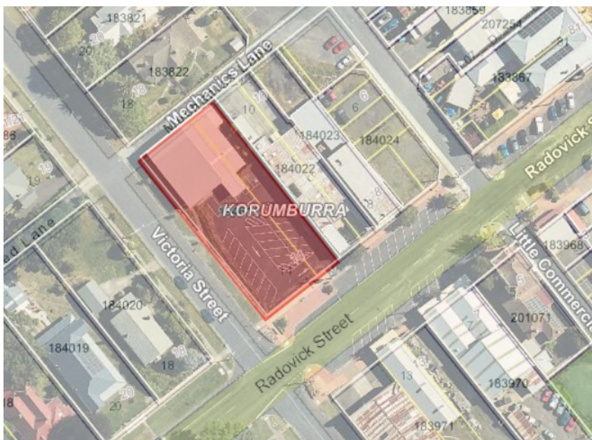
Figure 3 - 14 Radovick Street, Korumburra

This property is locally known as the “Korumburra Senior Citizens Centre”. The use of the building has been occurring on a handful of days a month. During the development of the Korumburra Community Hub concept, an area was provided within the new Hub to accommodate the Korumburra Senior Citizens with priority use for the days required. The club have vacated 14 Radovick Street and have not taken up their place in the Hub.