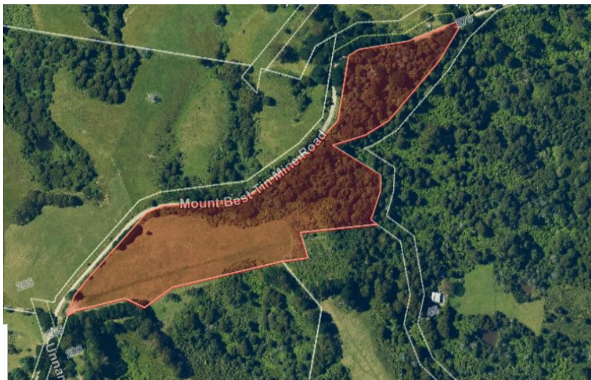
Figure 1 - 270 Mount Best Tin Mine Road, Toora North

This property is locally known as the "Mt Best Air Strip". The land was used in the past for planes to help combat fire in the region but helicopters have replaced planes and don't require a runway. The site also used to be used by agricultural spraying planes but there does not appear to have been used for this purpose in some time. The land is in a farm zone with an area of 6.219 Ha with approximately 50% vegetation. It is not proposed that Council apply for a planning permit for a dwelling.