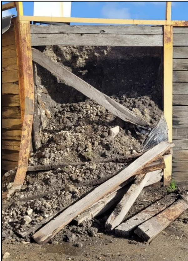
Figure 1 – Walkerville Transfer Station Failed Retaining Wall