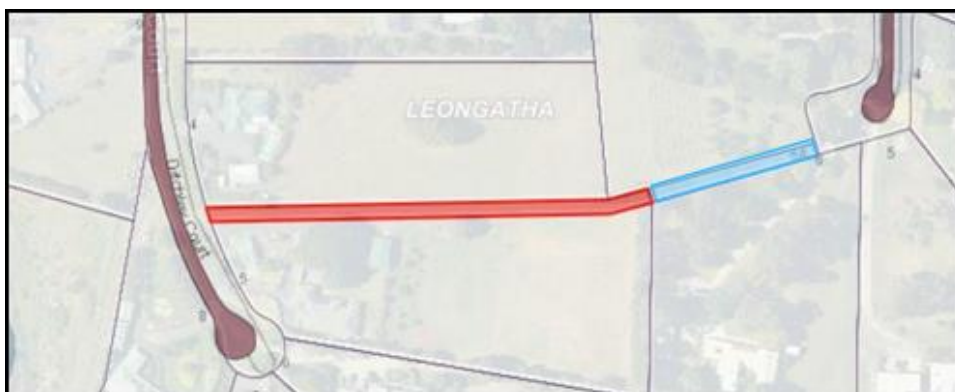
Figure 4 – Remaining Small Reserve Strip (highlighted blue)

If Council, choose to sell part of the reserve the small reserve strip off Davis Court will remain, but the community engagement process may produce interest in the site.