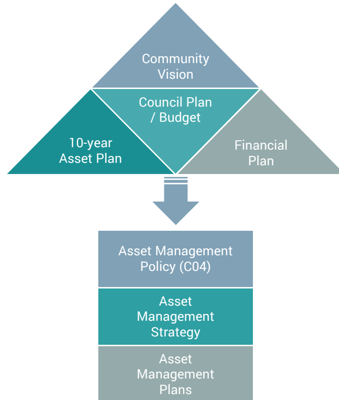
Figure 1 – Council’s Asset Management Documents

The introduction of the Local Government Act 2020 included a requirement for Council to develop and adopt a 10-year Asset Plan. Figure 1 below shows how the introduction of this plan correlates to Council’s key strategic plans and the asset management system documents.