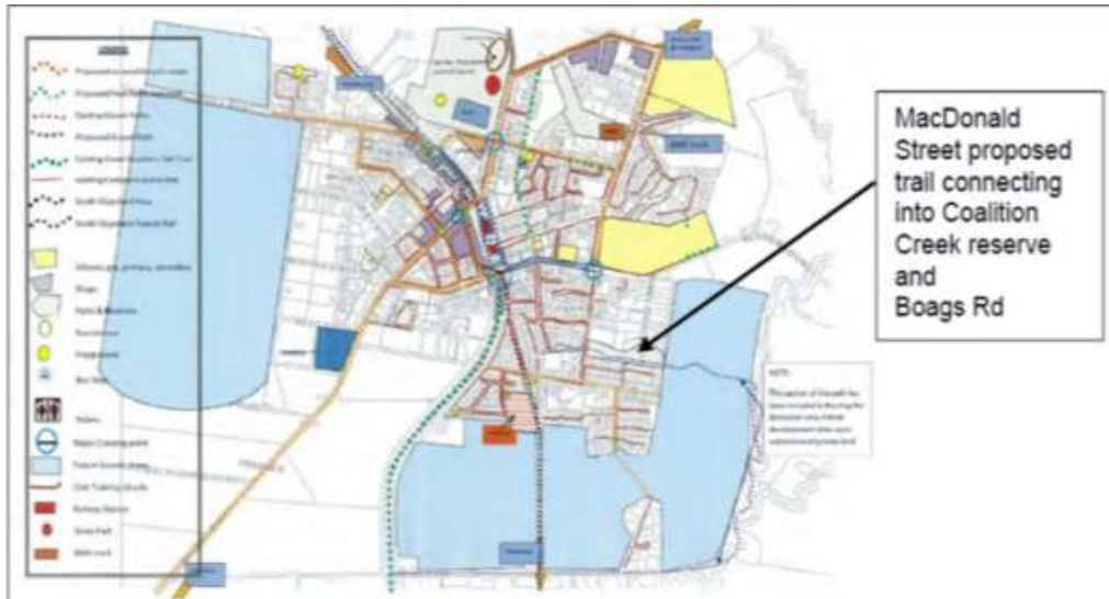
Figure 3: Leongatha Proposed and Existing Trails and Paths

Despite meeting the 1-kilometre linear access requirements to the Great Southern Rail Trail, Council acknowledges that there is a deficit of usable public open space in the general area of Warralong Court. Even with this being the case, 6A Warralong Court is not a site Council believes should be developed for Public Park and Recreation purposes.