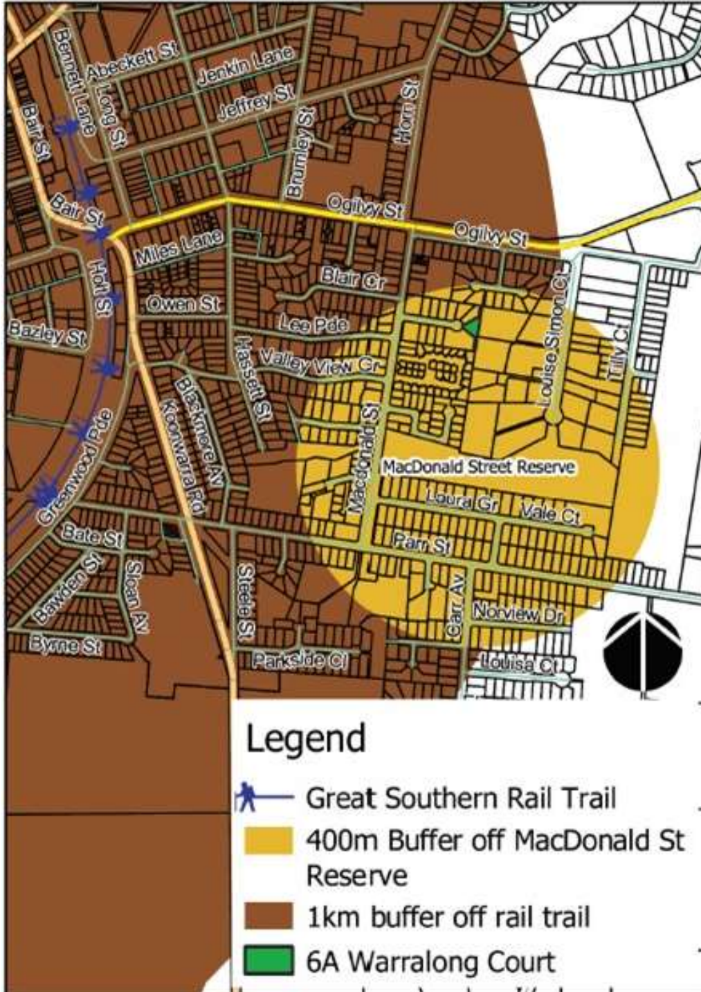
Figure 2: Analysis of Access to Public Open Space to Warralong Court

The South Gippsland Community Infrastructure Plan 2014 formed a reference document for the Paths and Trails Strategy 2018. Figure 3 is from the Infrastructure Plan 2014 indicating proposed