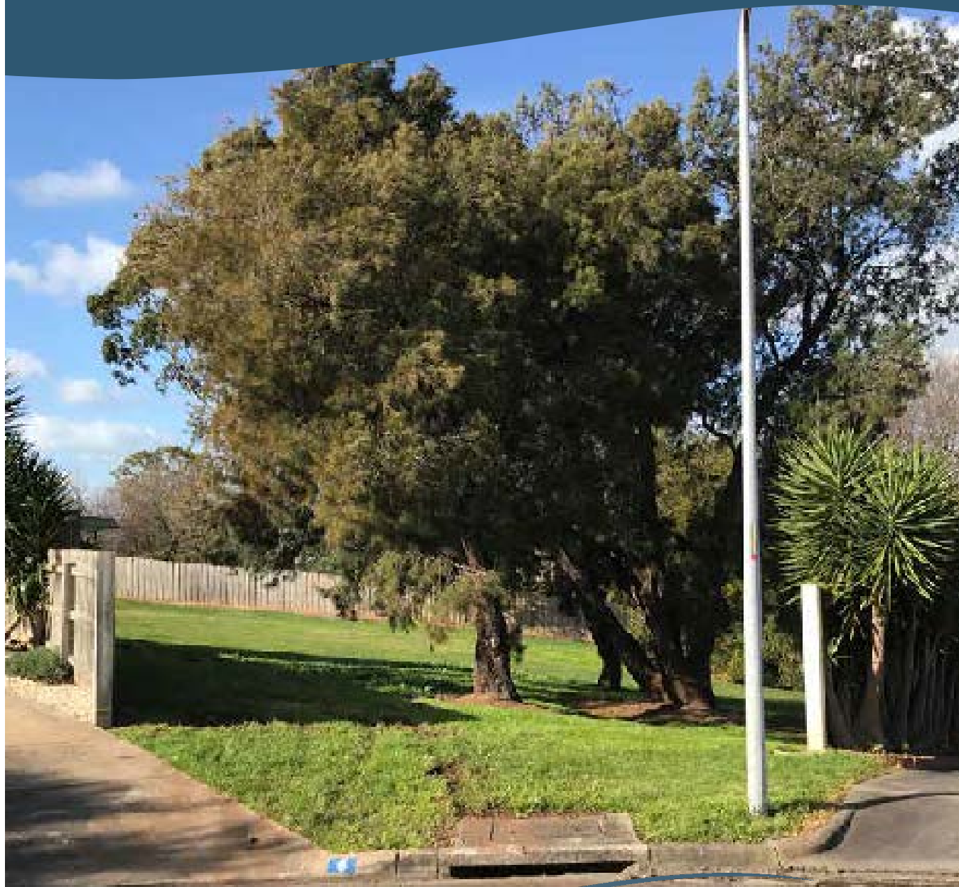
Warralong Court, Leongatha