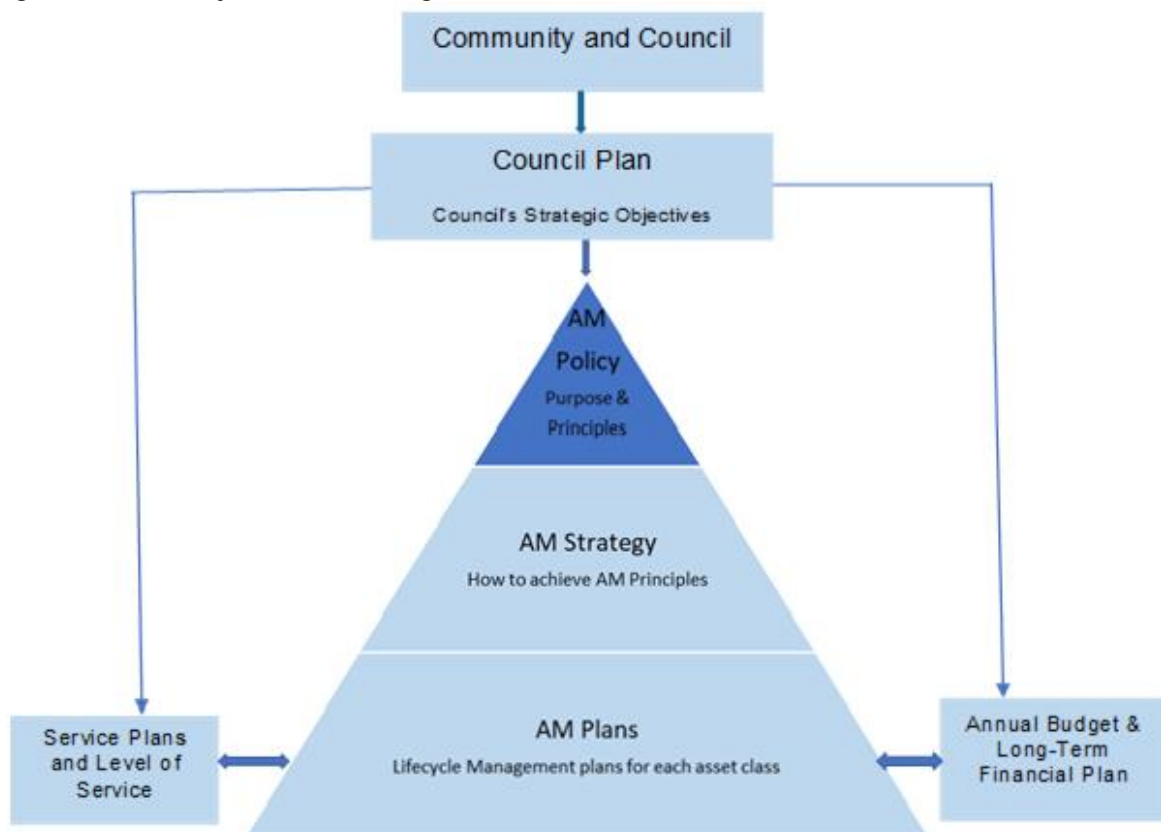
Figure 1: Hierarchy of Asset Management Documents

The Policy outlines the framework, guiding principles, roles, responsibilities, and risks associated with asset management at Council. The previous Asset