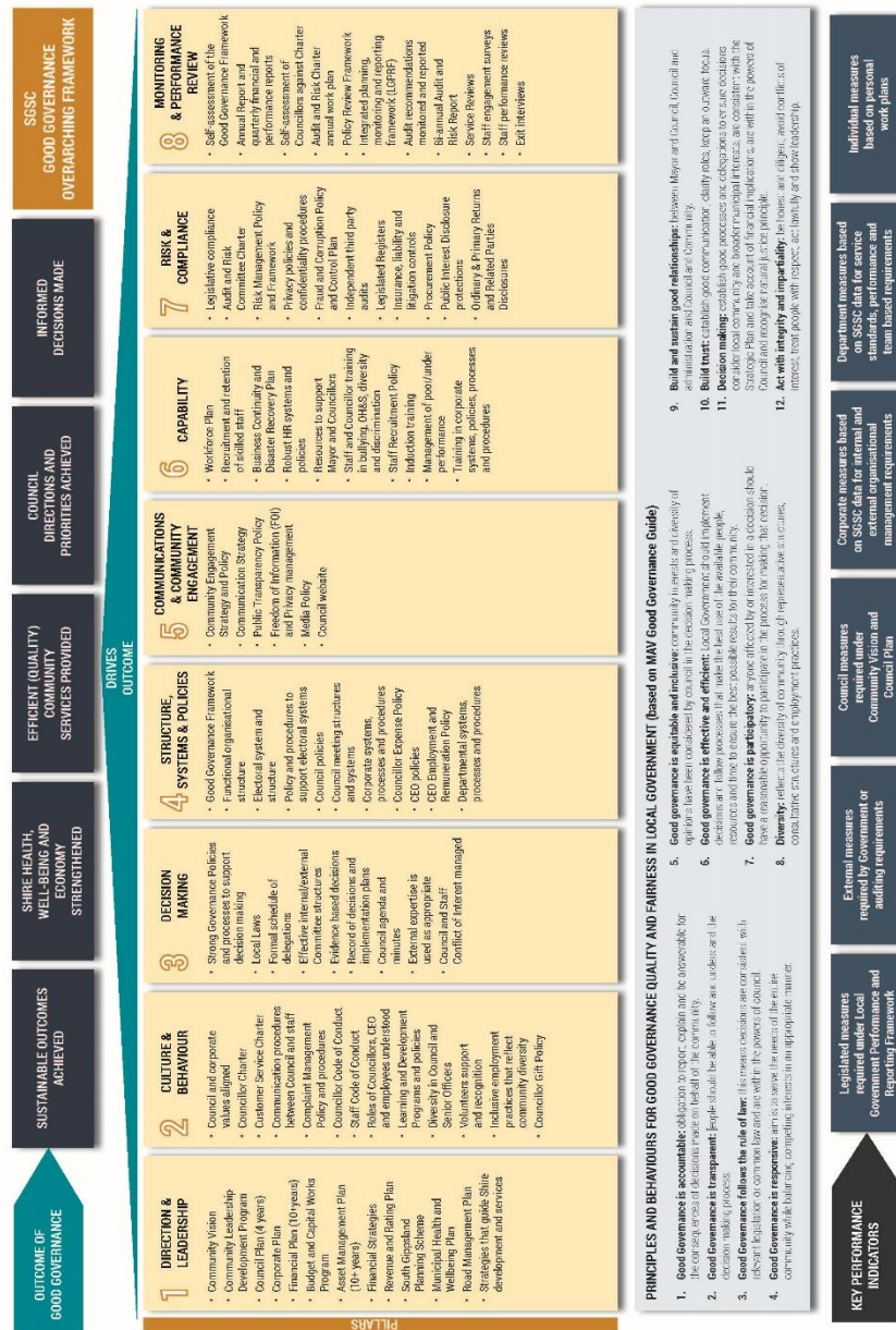
Table 1 – South Gippsland Shire Council - Good Governance Framework