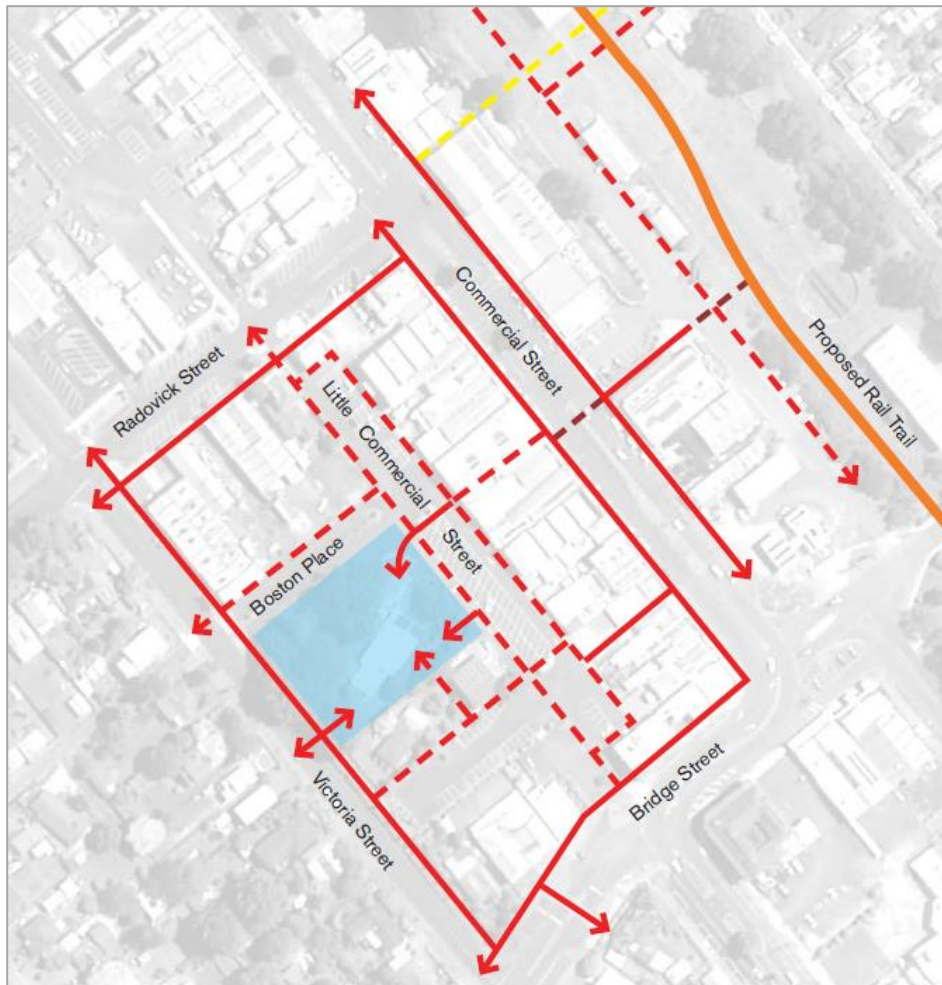
Figure 1 – Little Commercial Street Improvements