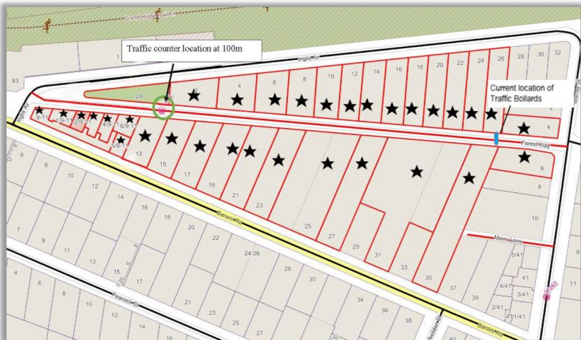
Figure 2 – Forest Way, Mirboo North Locality Map

In 2016, Council received a similar request stating concerns regarding increased traffic, vehicle speeds, and dust in Forest Way. A survey of abutting residents was undertaken in August 2016 asking a [Yes / No] response to moving the road closure in Forest Way from its current location near Murray Street to a location approximately 100 metres from Inglis Avenue. The survey