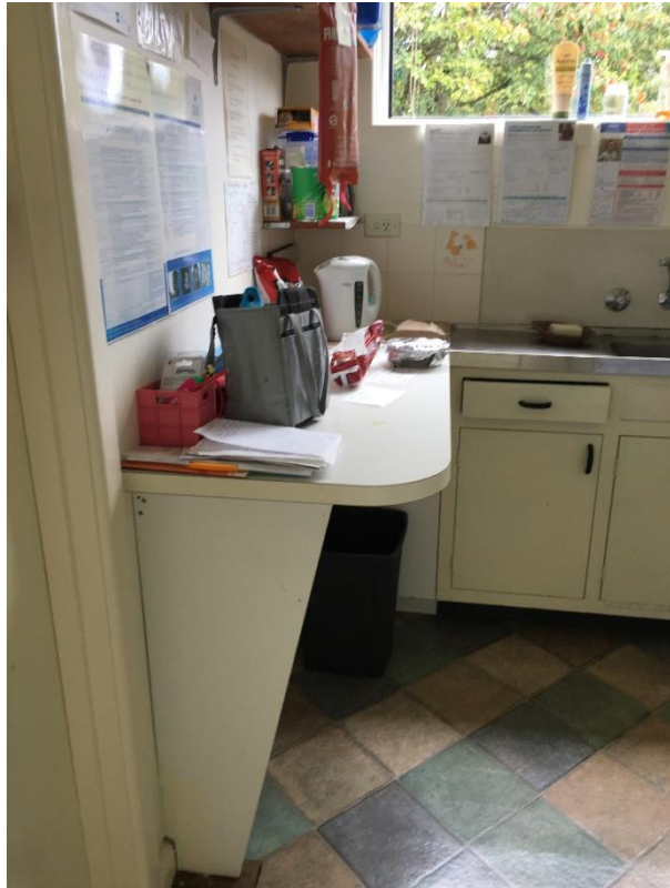
Welshpool Kindergarten, January 2019