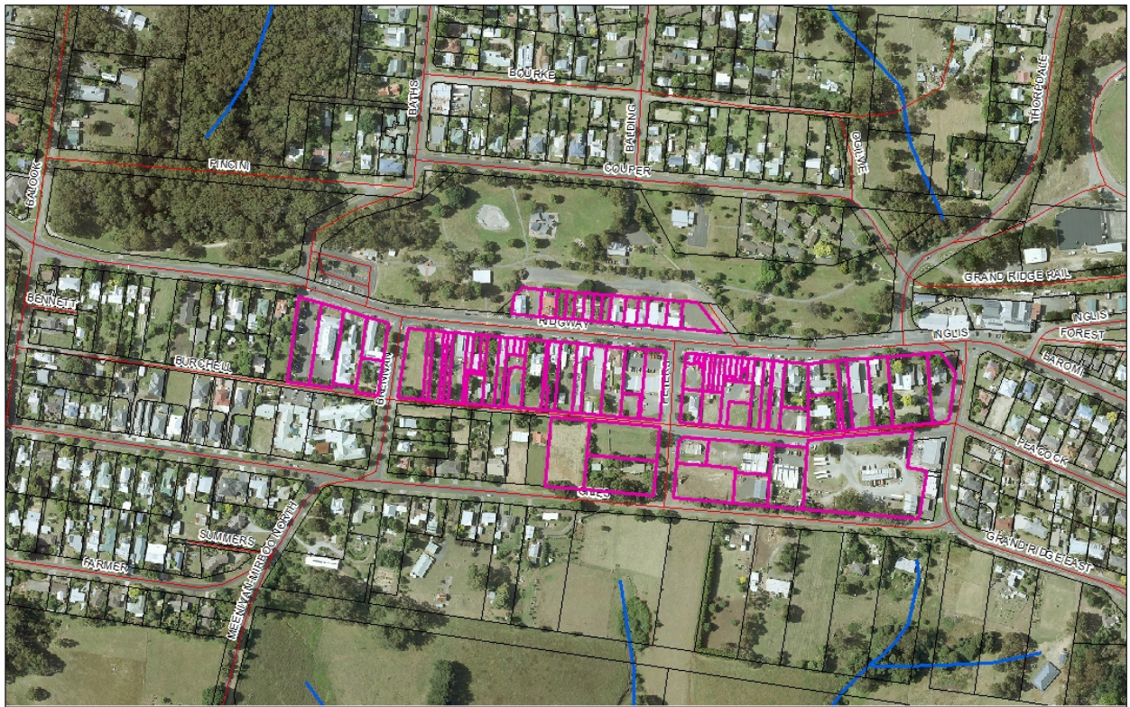
Figure 1 – Designated waterways