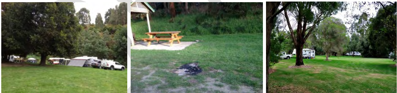
Lengthy stays and fires not in provided fire places are management issues of Franklin River Reserve