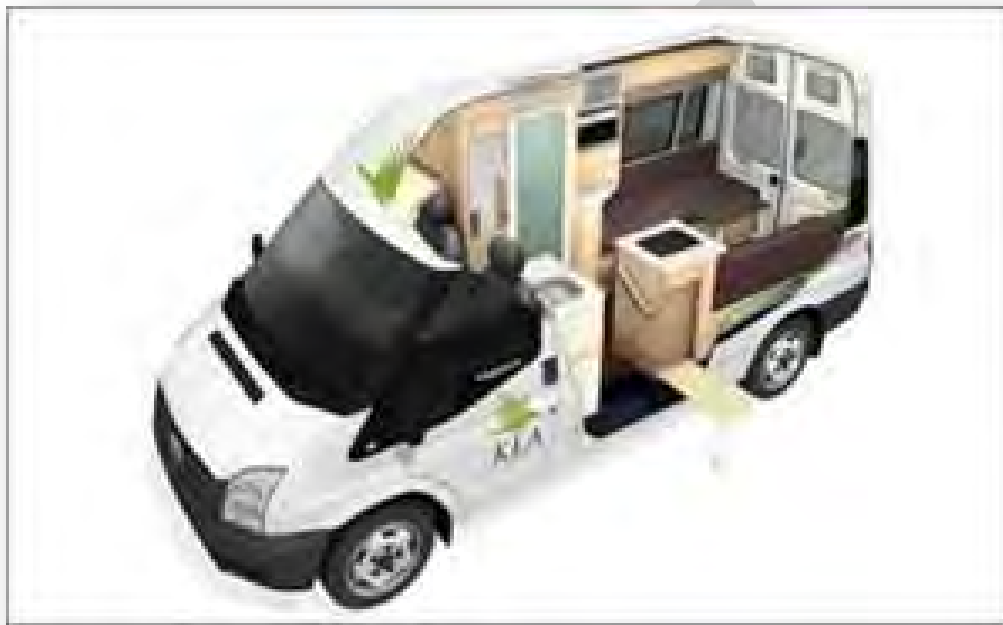
A self-contained recreational vehicle

33% of CMCA members predominantly stay in caravan parks, 51% stay at a mixture of no frills sites and caravan parks, with the remaining 16% always staying at a no frills site and never at a caravan park.